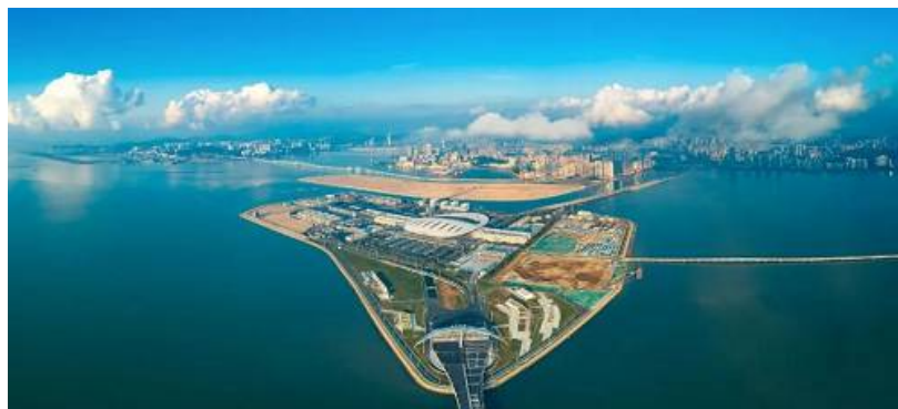
Figure 1 Geographical location of Guangdong-Hong Kong-Macau Greater Bay Area

The development of the region can not be separated from the intercommunication between urban communities. The proposal of Guangdong-Hong Kong-Macau Greater Bay Area is mainly aimed at the development and upgrading of the Pearl River Delta cities, including Hong Kong and Macao. As shown in Figure 1: