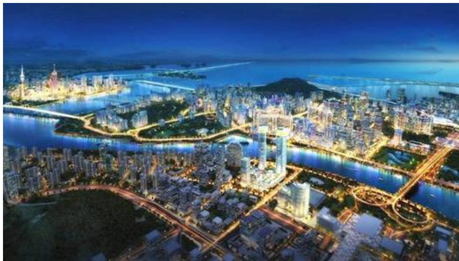
Figure 2 Guangdong-Hong Kong-Macau Greater Bay Area Industry Diagram (Part)

At present, the national economic development strategy for Guangdong-Hong Kong-Macau Greater Bay Area mainly includes infrastructure construction. Interconnection construction and the construction of comprehensive transportation system at home and abroad. And with the strategic development of Belt and Road in line, began to cultivate the industrial value chain of benefit sharing, constantly improve the efficiency of manufacturing transformation and upgrading. As shown in Figure 2: